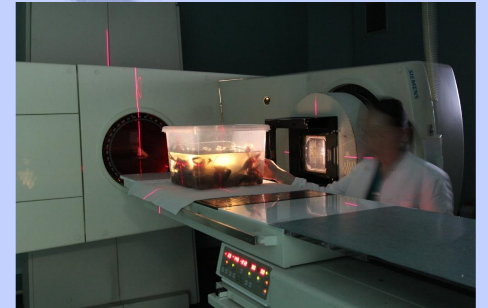
Figure 1. Linear accelerator and maintenance of the crayfish during the irradiation. Animals were treated in water at high densities in tanks covered with Plexiglas.

The open question was: How much high is the optimal radiation dose? An optimal radiation dose should be able to guarantee a more efficacious impact on male fertility without either compromising sexual responsiveness and competitive ability of the treated animals.